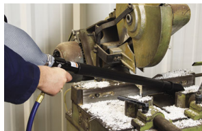
Model 6392 Vac-u-Gun All Purpose System removes plastic shavings from a saw.