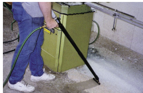
Model 6192 Vac-u-Gun Collection System with bag vacuums absorbent and chips.