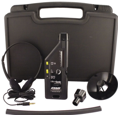
The Model 9061 Ultrasonic Leak Detector comes complete with a hard-shell plastic case, headphones, parabola, tubular adaptor, tubular extension and 9 volt battery.

In some cases, the suspected leak is in a hot area and/or close to moving parts. The tubular extension and parabola make it possible to probe these difficult locations from a distance to isolate the leak.