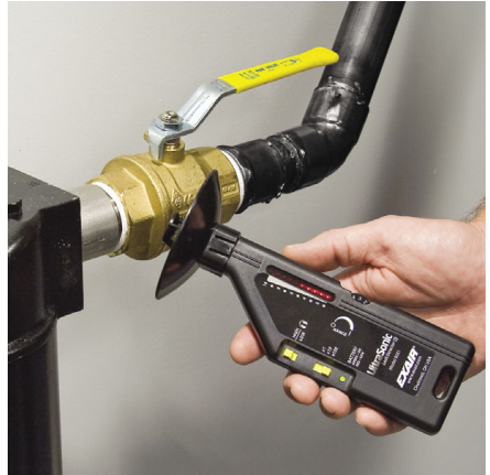
The Model 9061 Ultrasonic Leak Detector quickly pinpoints a costly leak in a noisy industrial environment.

Ultrasound is directional in transmission and is loudest at the source. Turbulence created by the air forced through a small orifice generates ultrasonic sound. This emitted sound is called “white noise” and occurs when the air moves from a high pressure area such as a pipe or vessel and escapes to a low pressure area such as the room. The Ultrasonic Leak Detector converts the turbulent flow to a frequency that can be heard using the headphones. As the ULD moves closer to the leak, more LEDs on the display light to confirm the source of the leak.